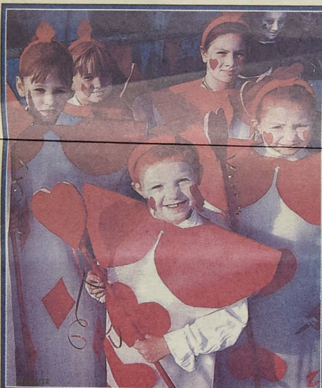
WONDERLAND: kids from the Emporium float

A police spokesman said: "That is the deal. If you retire on grounds of ill health you receive a pension and any disciplinary action is also stopped."