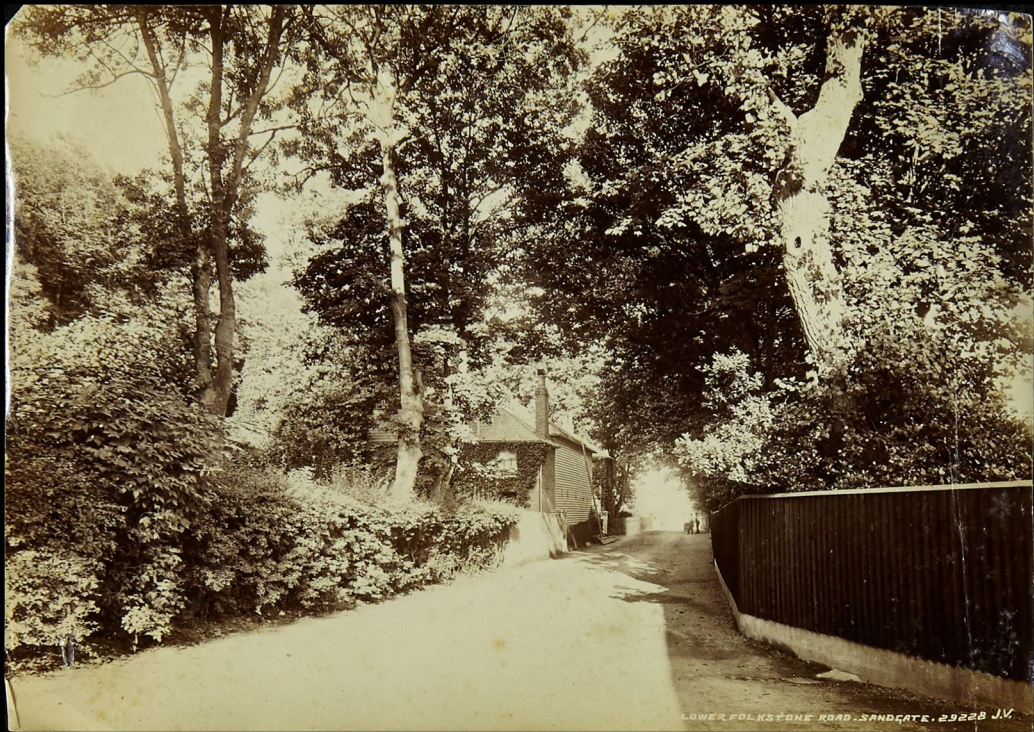
LOWER FOLKSTONE ROAD. SANDGATE. 29228 J.V.