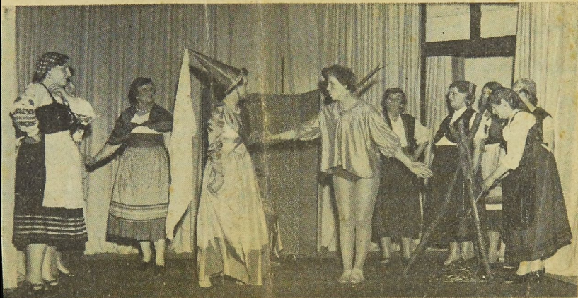
"The Wraggle-taggle Gypsies O!" was sung and acted by Sandgate Townswomen's Guild choir at the Guild's entertainment, on Friday and Saturday in the Chichester Hall.