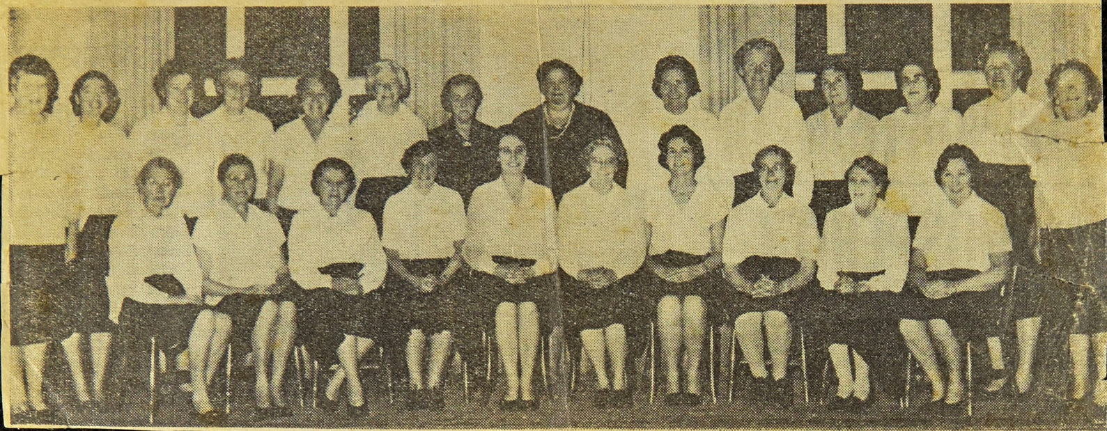
The Sandgate Townswomen's Guild choir which recently won its way through to the regional round of the national T.W.G. choirs competition. In the regional round the choir sang three set pieces and finished well ahead of the closest rivals.